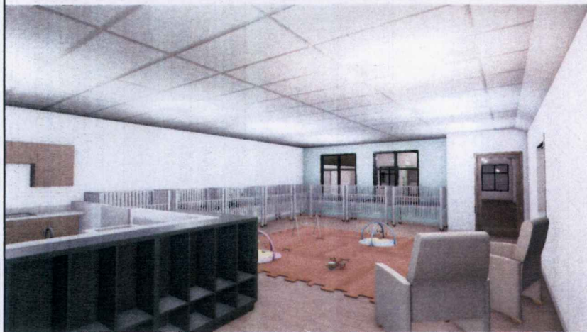
TYPICAL INFANT CLASSROOM

2001 N HUNT ST TERRE HAUTE, IN 47805 01.23.24 | PROJ #2315