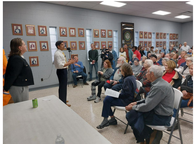
Mayor Sakbun and Representative Pfaff at their joint town hall on March 27th.

Welcome to the monthly newsletter from The Office of the Mayor, curated by Mayor Sakbun himself. This newsletter highlights upcoming City events, street closures, ongoing City project updates, public safety information, and whatever else the Mayor thinks you, the citizens, should be informed of this month.