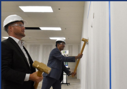
Mayor Sakbun attended the groundbreaking of the Excelsior Center on July, 31st.