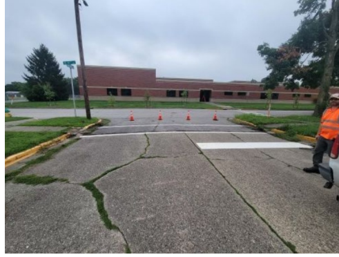
The new school year is just around the corner!